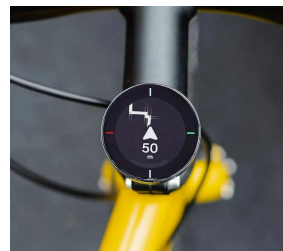
Threadless stem - compatible